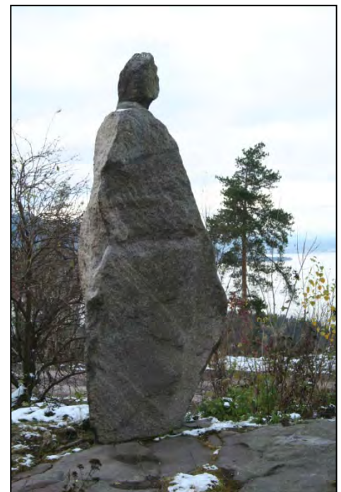
One of three figures watching over the landscape at a resting place along E16 west of Oslo.

Typical is the two figures outside my office entrance at the SCIENCE centre at the University of Oslo (the front page photo). The irregular shape makes the figures give the installation different character from different angles and a careful artificial light give a special and different impression in the dark. The bodies are made of local Silurian clay- and limestone and the two heads from a local lava rock (rhomb porphyry) and a breccia of meteoric origin from the meteor crater of Garnås some 10s of km west of Oslo. It is named "Interior and exterior forces", a fine multi-dimensional title that work both for the human and geological aspects of the sculpture.