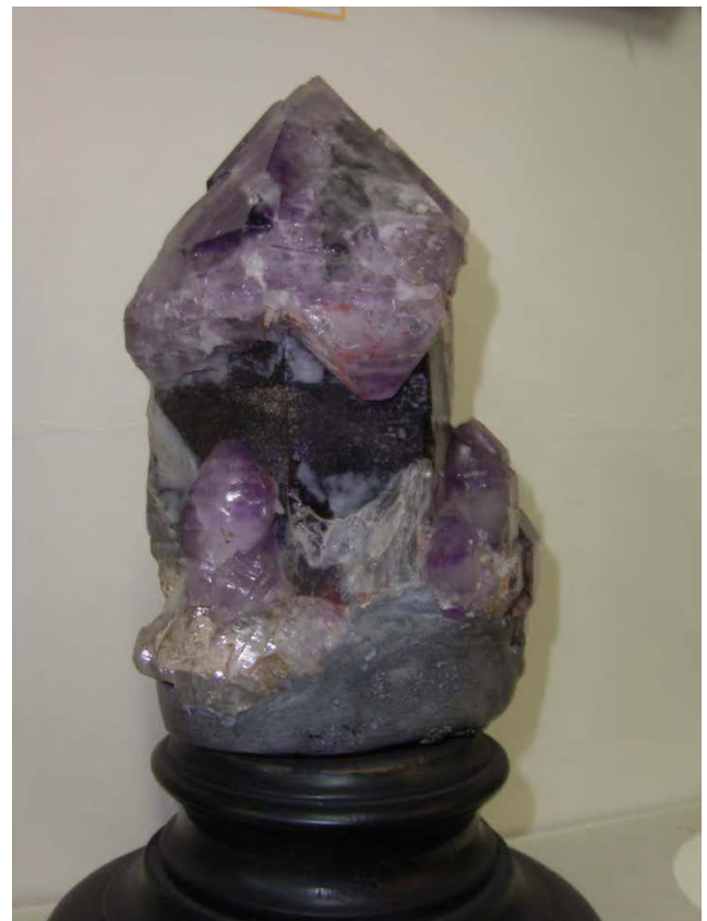
Amethyst, Blagoevgrad region

The mineralogical collection is repeatedly improved by specimens from Bulgaria and from abroad. Since 1990 the name was changed to National Museum of Natural History in Sofia. The mineralogical exposition is currently arranged in 3 halls (300 sq m) under the following topics: "Composition, structure, and properties of the minerals", "Systematic of minerals", (the systematic classification of Acad. Kostov), and "Genesis of the minerals". The samples are attended by original structural models, schemes, diagrams and pictures. The mineralogical collection keeps unique samples from Bulgarian localities (e.g. Madan ore district, Bourgas ore field etc.), as well as from foreign mineral deposits (e.g. Kola Peninsula, Greenland and Australia). Until the end of 2007, an inventory of 8667 samples has been taken, and today the mineralogical collection is known to contain 949 mineral species and 94 mineral varieties, minerals from 216 type-localities and 203 mineral species from Bulgaria. The collection includes the holotypes of minerals such as strashimirite, kostovite, balkanite. Some of the samples are author's specimens of Bulgarian and foreign scientists. The museum cares also Russian and American mission samples from the Moon. Through its notable scientific collections and its impressive exhibitions, the Museum has gained the reputation of a widely respectable institution over the years.