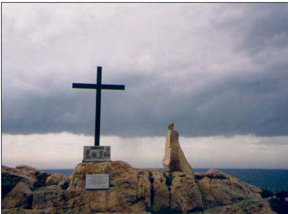
"Woman from Calvi" ("Dame de Calvi") placed near a memorial after a ship catastrophe on Corsica.