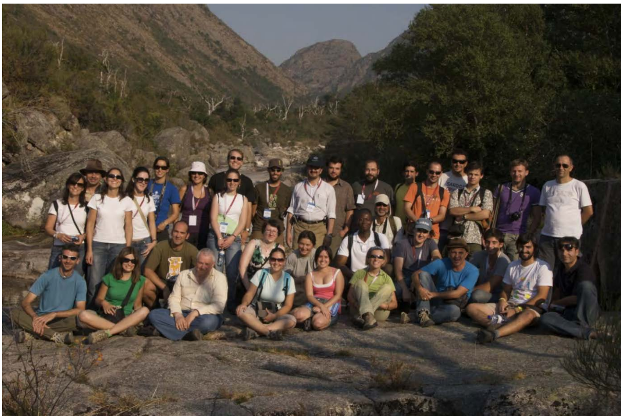
Participants of the fieldtrip at Peneda-Gerês National Park

In a section called "New Researchers on Geoconservation", all participants presented the projects that they are presently worked with. This was very interesting, as it allowed the exchange of experiences between the members of the group and also made possible for all, to have an idea of ongoing research projects about geodiversity and geoconservation in many countries, located in different continents around the world. It must be pointed out, the presence of a member of the Geological Survey of Iran, who made a lecture about the Iranian geodiversity, which surprised most of the participants with the variety of landscapes and different is-