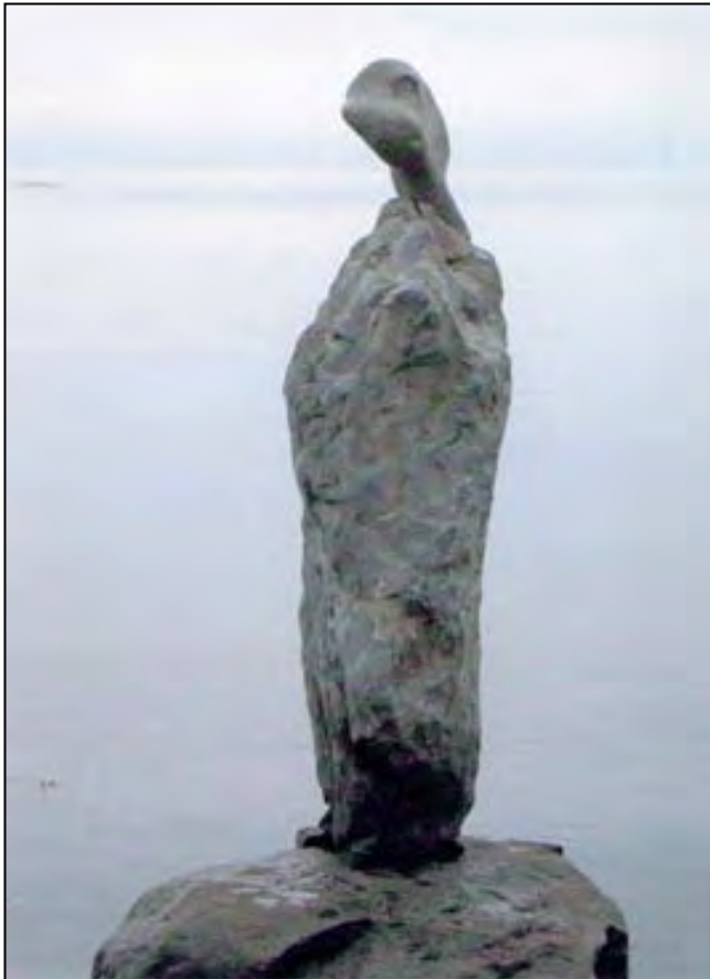
"Neptun's Eye" placed at Sellafield, England. The project is financed by private persons as a protest against nuclear waste.

The same could clearly be seen in a millennium exhibition in the city hall of Oslo. The name of the exhibition was "Time, man and the earth". And some few short poems were also presented in the exhibition introduction. These do also tell about the perspective of this artist as it is linked directly to Geoheritage - "the memory of the earth". In a crude translation a couple of these poems can be cited: