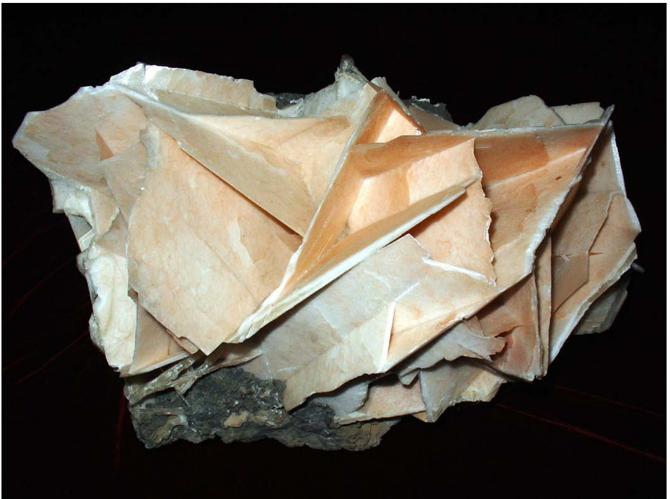
Calcite, Burgas region

The museum was officially opened to the public in 1907. A luxury 484 page catalogue came out, Collection du Musée d'Histoire naturelle de San Altesse Royal Ferdinand I de Bulgarie , describing the exhibits, including 899 minerals and organic mineral products. The subsequent development of the Museum was closely linked with the work of the outstanding Bulga-