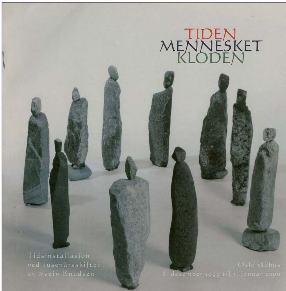
The introduction to the millennium exhibition at the city-hall of Oslo.

The artist, Svein Knudsen, has specialized in stone, and not only marble and granites, but common and local stones. His figures consist typically of a big body and a head, carefully selected from raw stone blocks of different, often local stone. The shape of the stone is very carefully shaped leaving the raw impression that make the stone itself talk. The shape of the figures changes from different viewpoints and with different light and trigger personal imagination. They celebrate the diversity of this earth, trough all times.