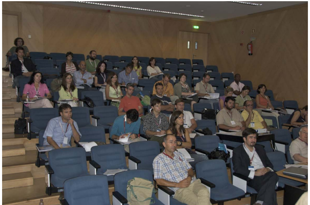
Participants during lectures at the University of Minho