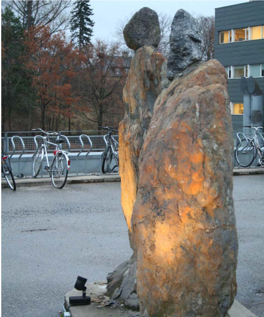
"Interior and exterior forces".