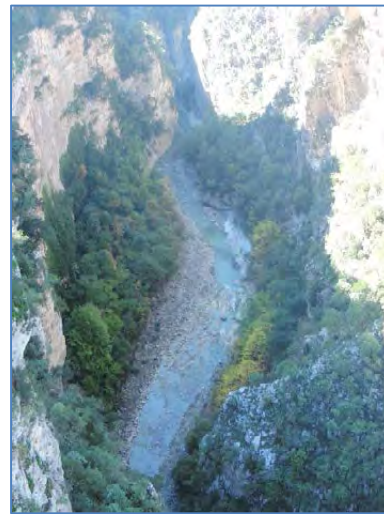
Lengarica Canyon