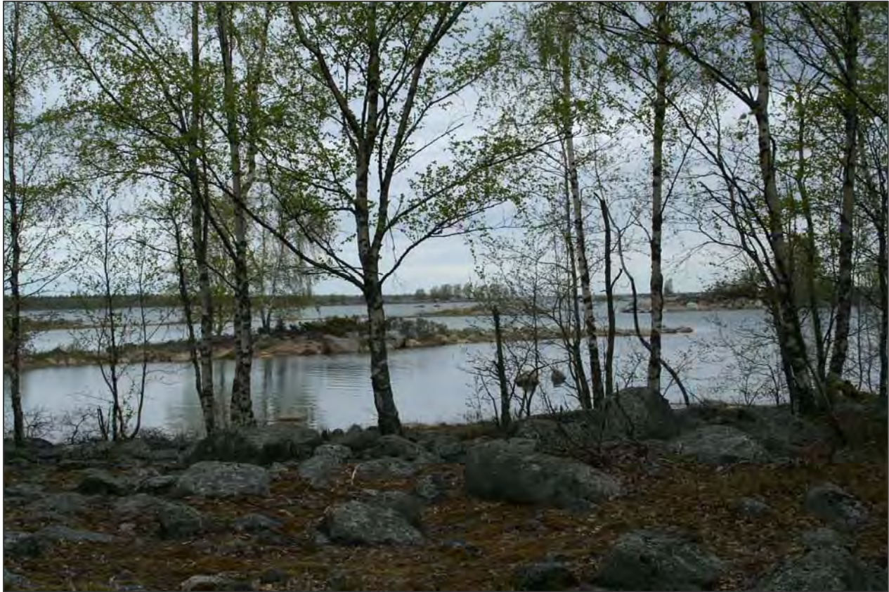
DeGeer moraines in the World Heritage area of Kvarken in the Vasa arkepaligo in Finland. ProGEO regional working group no 3 for Northern Europe had its meeting here in may. Report from the meeting will come in the next issue of ProGEO NEWS

Deadline for the next issue of ProGEO NEWS: 1.10.2007