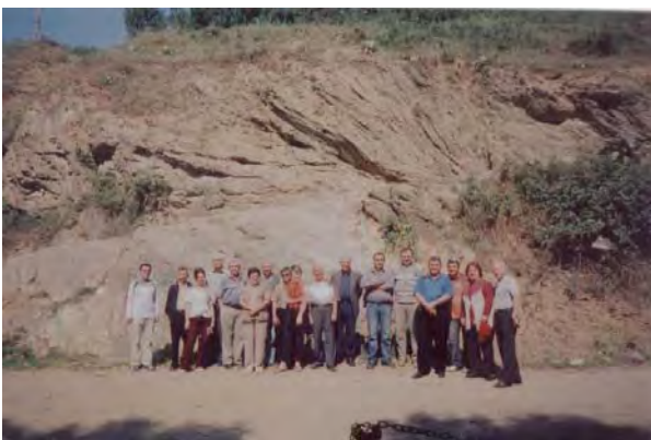
Photo 4: ProGEO-Albania participants in an outcrop of paleozoic rocks in Muhri stratigraphical section.

In the second day our tour we first continued to the Bellova salt dome (Photo: 3), Thermal Sulfur Water springs, and thermal bath hospital. The last stop was dedicated to the Muhri stratigraphic section of Paleozoic rocks (Photo 4).