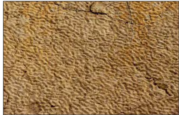
Ancient ripples at Wrens Nest

Graptolites, the biostratigraphic 'indicator' fossils used to match up certain sequences of Silurian rocks in different areas, are extremely rare in the limestones of Dudley. However, several specimens of the species Monograptus flemingii have been recorded. This fossil is only known from the middle of the Homeric Stage of the upper Wenlock Series. Graptolites found in the limestones at Wenlock Edge are slightly younger than