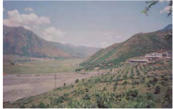
Photo 2: Common view of Bulqiza chromite Deposit, beneficiation plant, and Vaikali glacial Valley.

Crossing the ultrabasic massif along the road and the long water reservoir, we entered the Burreli Depression filled by thick molasses of Neogene age. Thick packets of sandstone, marl and clay sediments are seen on both sides of the road, which crossed the depression from the north to the south. Different erosion figures are formed on the surface of the sandstone. In the central part of the depression Burreli city, the center of this region is located.