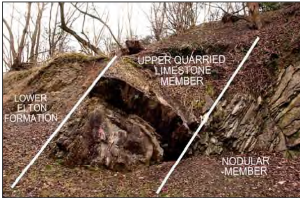
Border zones between formations, educational illustration.

and severe erosion. During the Lower Carboniferous much of England and Wales was subject to subsidence and a re-invasion by the sea, but it seems probable that some western parts of the Midlands, including Dudley, remained above sea level and underwent further erosion.