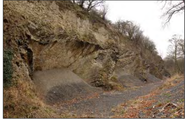
The Seven Sisters caverns today

limestone from Much Wenlock in Shropshire. The limestone workings at Mons Hill were abandoned much earlier.