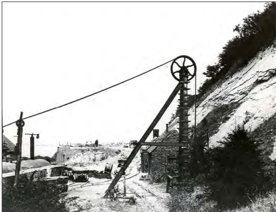
Wrens Nest West mine

Wrens Nest West mine Wrens Nest West mine