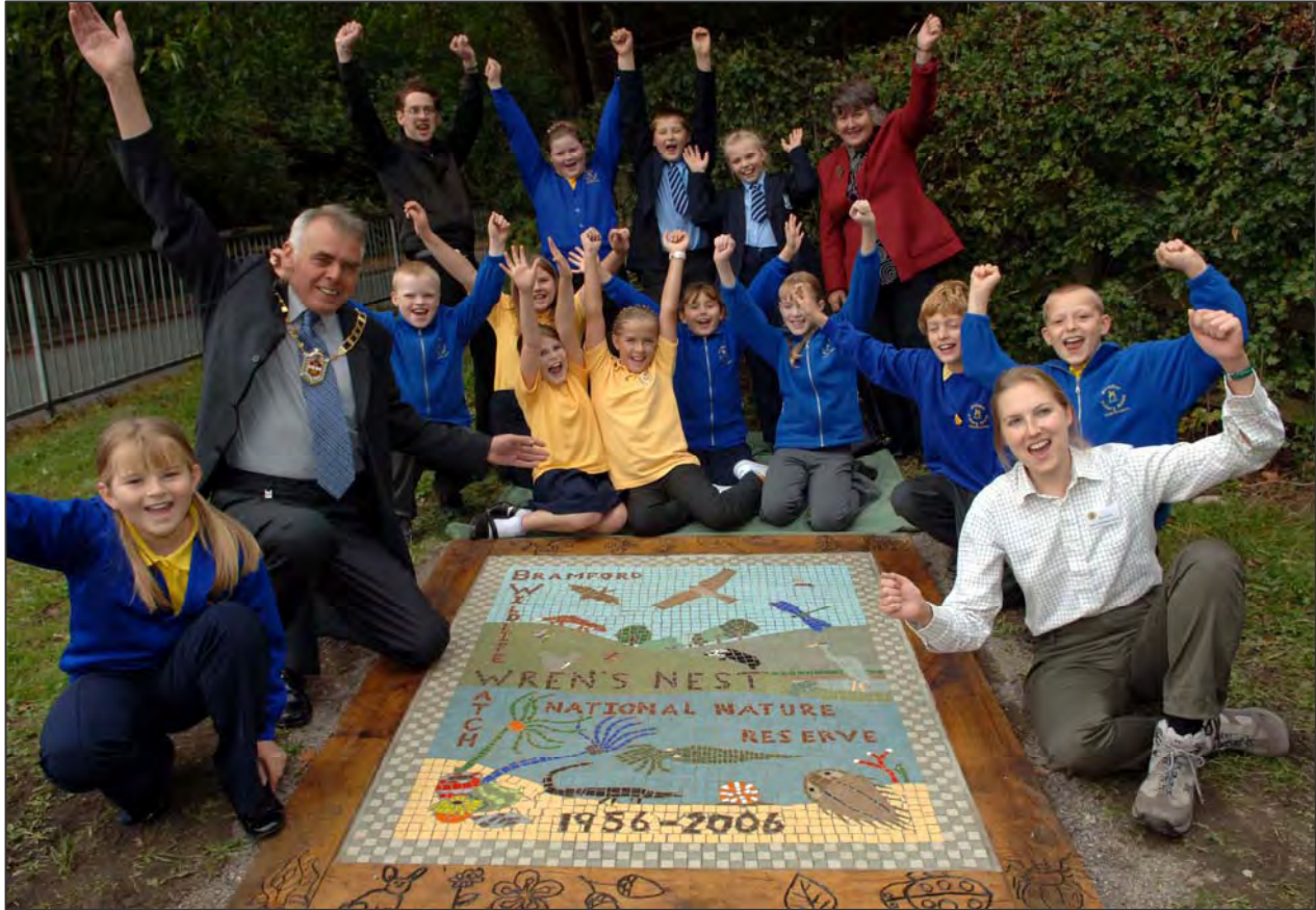
Education and local involvement is important in the Wren's Nest National Reserve