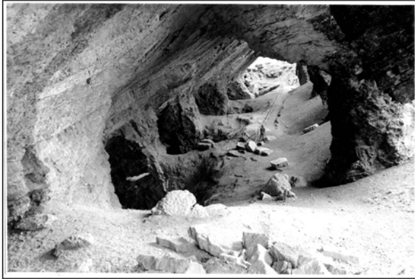
The Seven Sisters caverns in the 1960's

At first the limestone was worked in open quarries for building stone and for making agricultural lime and lime mortar. Towards the end of the 18th century there was a great rise in demand for limestone, particularly for use as a flux in the local iron furnaces. To meet this demand and in view of the approaching exhaustion of the quarries, extraction began underground and the limestone was raised firstly from adits, and later from pit shafts.