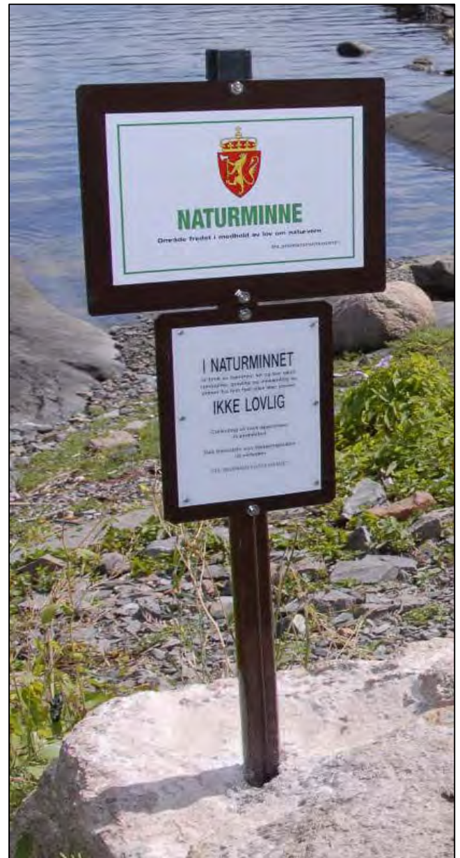
Typical signpost on these geosites. (Naturminne = Natural monument. Ikke lovlig = not legal, that is "forbidden").

Every now and then, such dispensations are given and therefore published scientific work, which includes these protected localities, becomes available. Better system of application procedures, report systems and monitoring is however identified as a need.