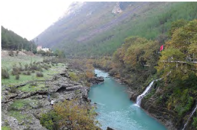
Kelcyra springs, and Vjosa River terraces.