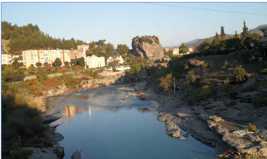
Permeti Town's Stone, Albania

The coming events and meetings of the Global Geoparks Network (GGN) are announced on their web site http://www.globalgeopark.org/english/ and on Unesco's web site http://www.unesco.org/new/en/natural-sciences/environment/earth-sciences/geoparks/ .