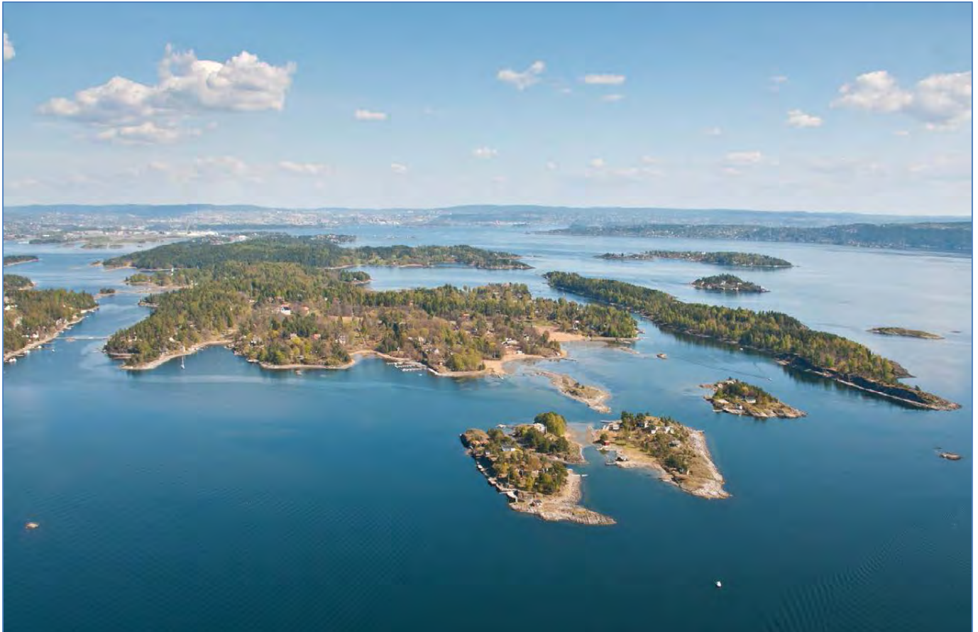
Elongated limestone ridges forming an island archipelago in the inner Oslo fjord. City of Oslo in the background.