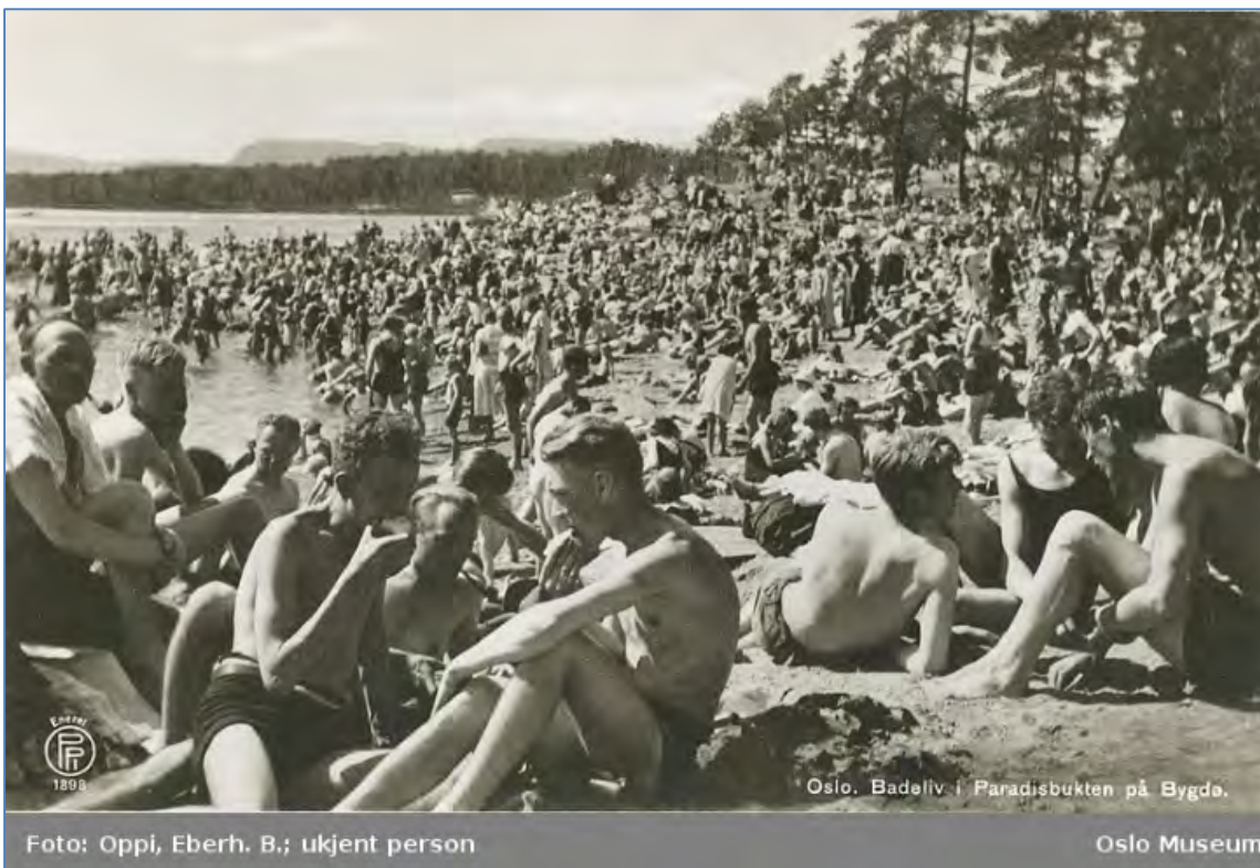
One of the geosites protected in 1988 is one of the most popular beaches in Oslo, here on a hot summer day in 1930.

Besides fire damage, graffiti, small constructions near the water have been identified as the main problems. For the use of the geosites in scientific work, education and for common geological experience other challenges have also been identified for the management.