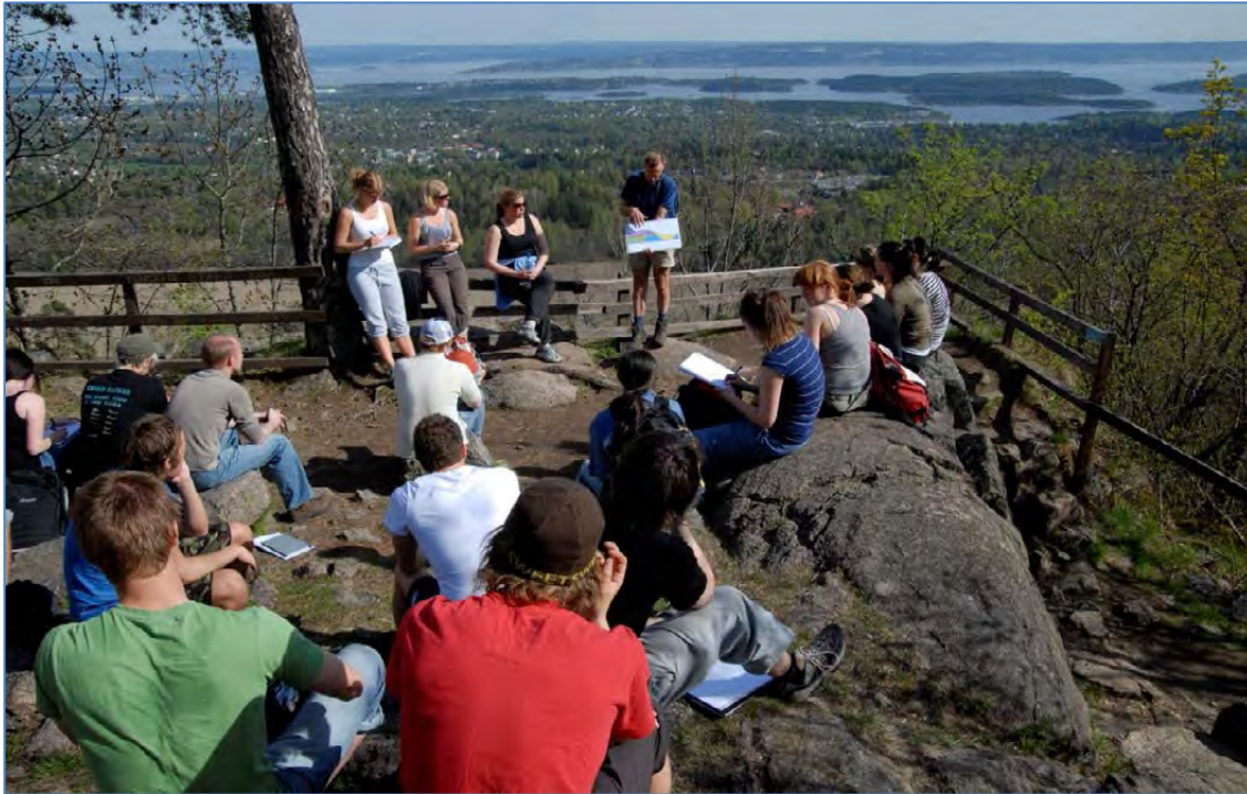
Students on top of the Permian lava plateau looking down to the Oslo fjord with the limestone ridges and in the far distance the main fault line of the Oslo graben.

be stable in the years to come, but their state will be improved by better management related to the overgrowing issue, better information and increased awareness by the population.