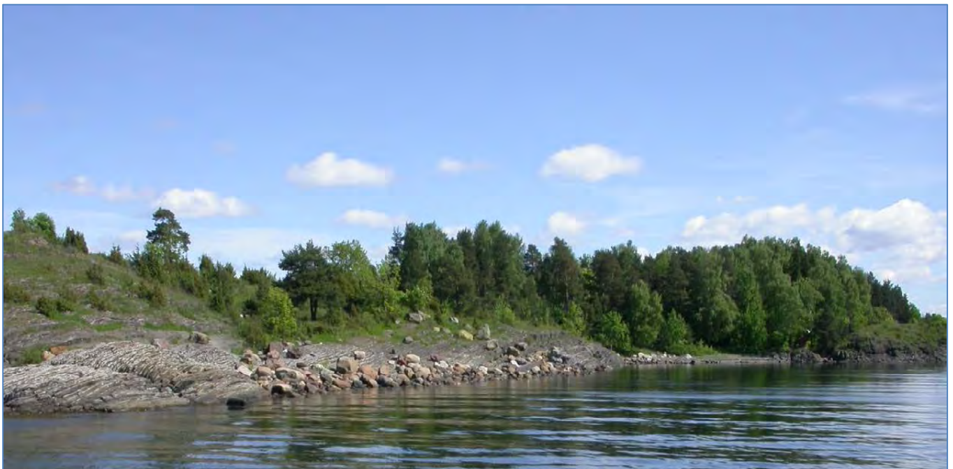
Typical shore-line of the Oslo Fjord situated on the elongated island to the right in the front picture.