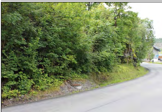
Small fires and one-time grills have the potential of rock destruction within the geosites (upper picture, photo: Hans Arne Nakrem). Overgrowing of bushes and trees, some places also lichens and mosses make the outcrops difficult to study (lower picture, photo: Ole A. Hoel).

The main problem is overgrowing which can be seen in most of the localities that do not form a direct coastline. Lichens, mosses, bushes and trees are covering many outcrops and make them difficult to study. The main future management challenge is to improve in the clearing of vegetation on key outcrops, and keep them open so they can fulfill their task as a scientific and educational resource.