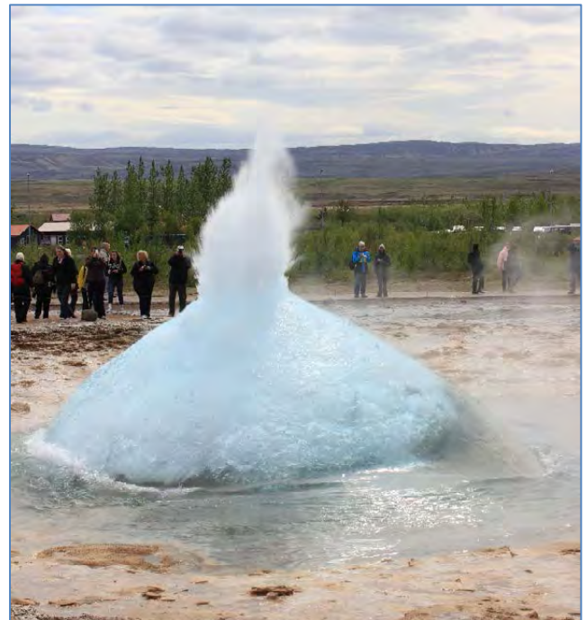
The geyser “Strokkur”, Island.

The first circular may be expected this autumn and more information will then be available in ProGEO NEWS and on www.progeo.se .