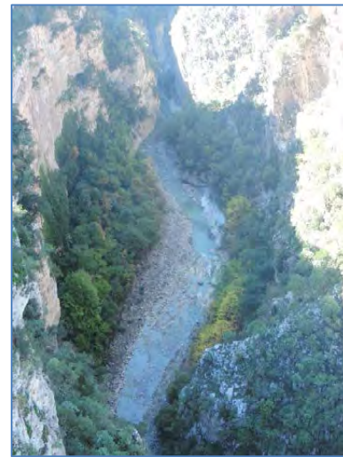
Lengarica Canyon