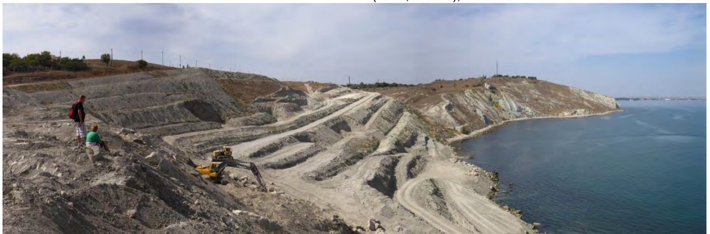
Fig. 2. The scale of excavation works is shown on sea conservation zone