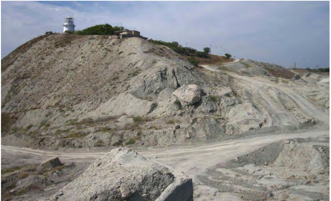
Fig.3. Destroyed slope near light house

(1985) and others paid attention to these deposits, but a common point of view about the boundary position has not been reached.