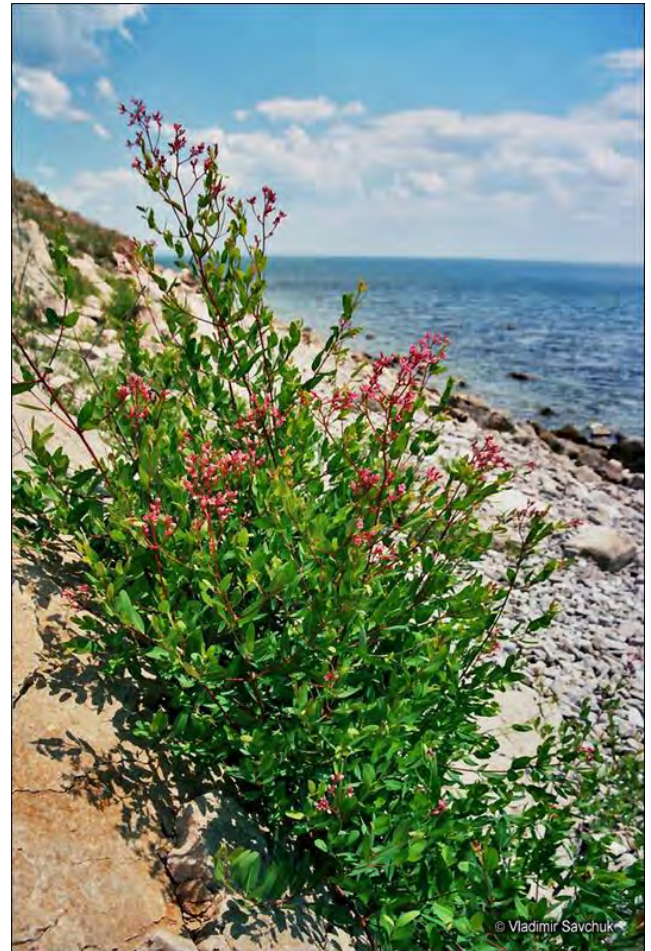
Fig 5. Trachomitum venetum subsp. Sarmatiense.