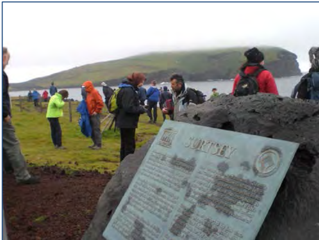
At the Surtsey conference one day field excursion was to Heimaey, Vestmannaeyjar.

Geological studies at Surtsey have for the first time demonstrated that the conversion of tephra into palagonite tuff is a post-eruptive process, occurring at relatively low temperatures, usually below 100 °C and at low pressures. The process is shown to be highly temperature dependent and proceeds much faster than anyone had envisaged. The first sign of palagonitisation was noticed in 1969 at the surface of Surtsey but now some 85% of the tephra piles above sea level have been converted to palagonite tuff. Surtsey has provided a well-documented case of the consolidation and alteration of basaltic tephra.