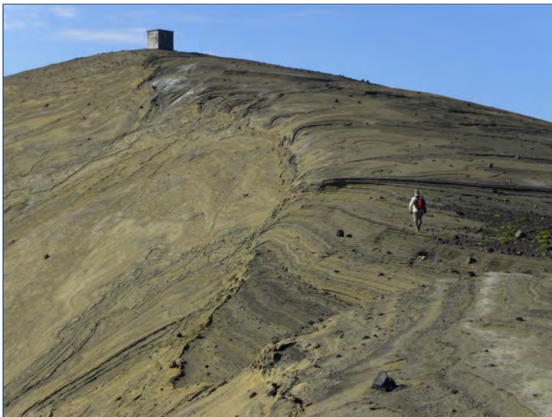
The eastern tuff cone, Austurbunki in Surtsey, and the old lighthouse at the top. The tephra layers in Surtsey have consolidated into palagonite tuff due to hydrothermal activity.

In 1964-1966 three smaller volcanoes, Surtla, Syrtlingur and Jólnir, rose from the seabed close to Surtsey. Surtla (1964) never reached the surface, while Syrtlingur (1965) and Jólnir (1965-66) formed islands that were quickly eroded by the sea once eruptions ended. Today the Surtsey crater system forms a 5.8 km long ridge, mostly submarine, covering a seabed area of 13.2 km 2 .