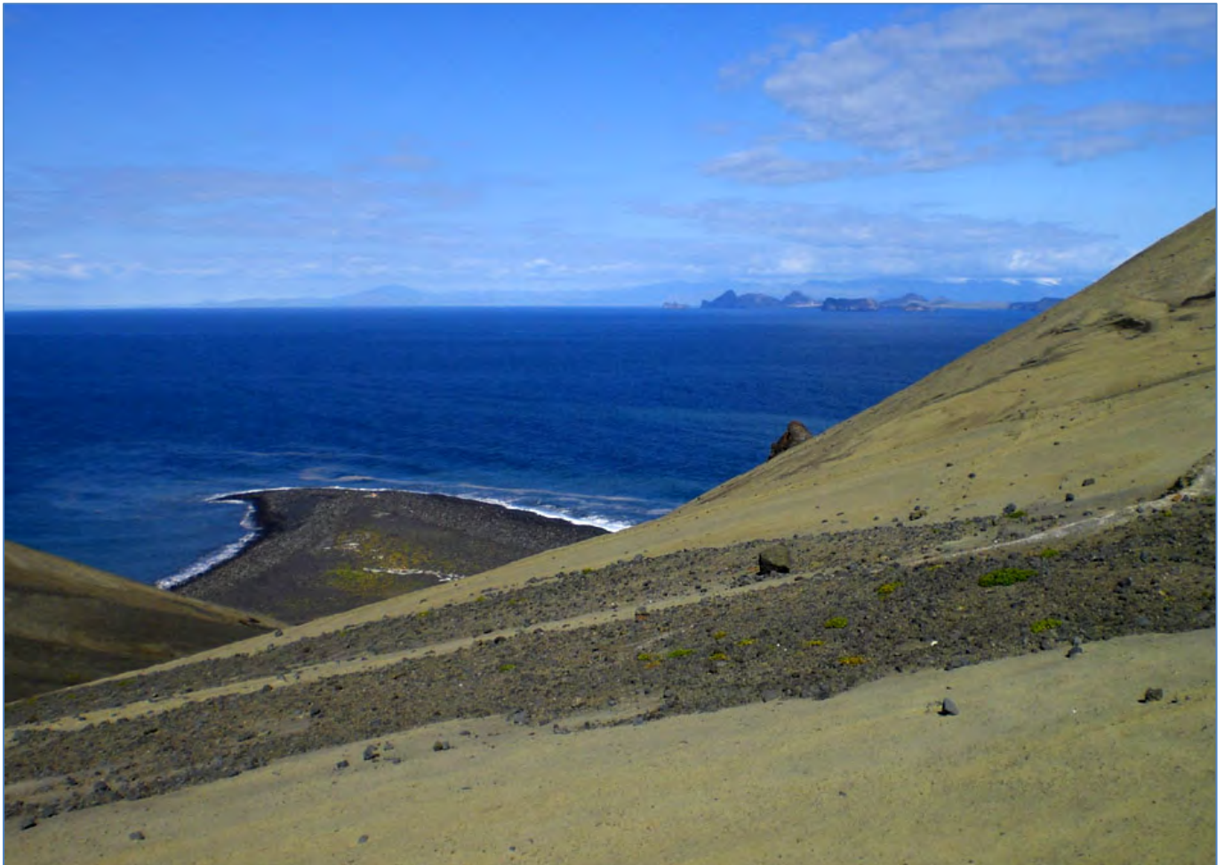
Surtsey is the southernmost island of the Vestmannaeyjar archipelago. A view from Surtsey to northeast.