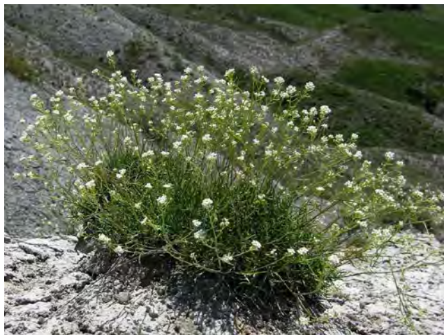
Fig. 4. Lepidium turczaninowii .

We consider the construction work as illegal because it is carried out in buffer zone of the sea coast. This activity was the reason to send a request letter to the Ministry of Ecology and Natural Resources of Ukraine.