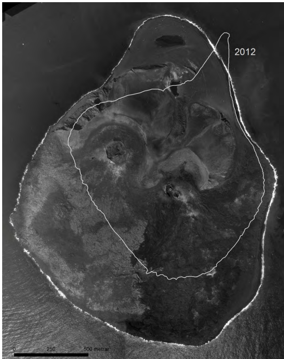
Aerial photo of Surtsey from 1967 with the outline of the island from 2012. Only half of the island remains.

Surtsey has provided a unique opportunity to study the evolution of a post-eruptional hydrothermal system. The hydrothermal activity was discovered in the spring of 1967 and has been monitored ever since. Since 1995 the surface temperature appears to be declining by about 1°C annually.