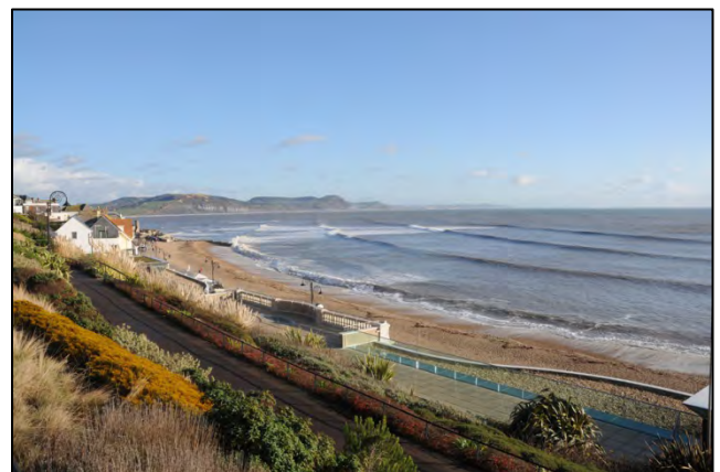
The West Dorset coast from Lyme Regis. A large swell wave on the 16 th December 2011, destroyed at least one fossil fish on Monmouth Beach and led to the discovery of a large ichthyosaur on Broad Ledge (record 275).

Under-reporting of specimens and the concern that specimens are 'lost' to collectors and/or the commercial market was raised but, as noted by a number of respondents, far greater is the threat of loss to the sea through erosion. As collecting is the only mechanism to prevent that loss and as, in our view, it is impossible to provide the current level of collecting effort which typically rescues the important specimens just in time, (they can only be found once exposed by erosion) it follows that working with collectors on the basis of trust and mutual respect will increase the chances of important specimens being placed in accredited museums, while adopting a more legislative approach is liable to increase the loss to the sea and/or drive collecting underground. The recording scheme means that specimens are not 'lost' to private collectors. Even if these specimens reside in private collections that must be preferable to their total loss to the sea. The principle adopted on the Jurassic Coast is that collecting, if undertaken in a responsible manner and following the principles set out in the Code, is an essential part of conservation and study on this site. Maximising reporting in accordance with the Code and maintaining efficient records is critical to the successful management of the site.