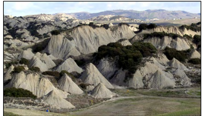
Given the clayey Pleistocene bedrock, in a wide area across the Potenza and Matera Provinces developed a typical badland landscape created by the age-old surface run off. The badlands, "calanchi", in Italian, characterize the rough landscape of south-eastern Basilicata. The charm of this scenery has been described by Carlo Levi in its novel "Cristo si è fermato ad Eboli" (Christ Stopped at Eboli), published in 1945. A regional park has been established to protect and preserve the wild beauty of this area.

Participants are invited to attend the pre- and/or post-Symposium field trips to the Gargano National Park, Salento Peninsula, Southern Appennine –Appennino Lucano National Park and Matera and the Apulia Foreland – Alta Murgia National Park.