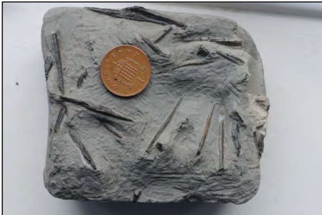
Record 272. Close up views of parts of an as yet unidentified fish, possibly a condroctian, found by three different collectors from the Spittles landslide in the autumn of 2011. No one has seen anything like it from the Lower Jurassic in this area. Despite the local collecting effort, several blocks have probably been lost to the sea or possibly remain to be washed out of the landslide. Scale: the 1 pence piece is 2 cm (One of the code review recommendations; use standard scales!)