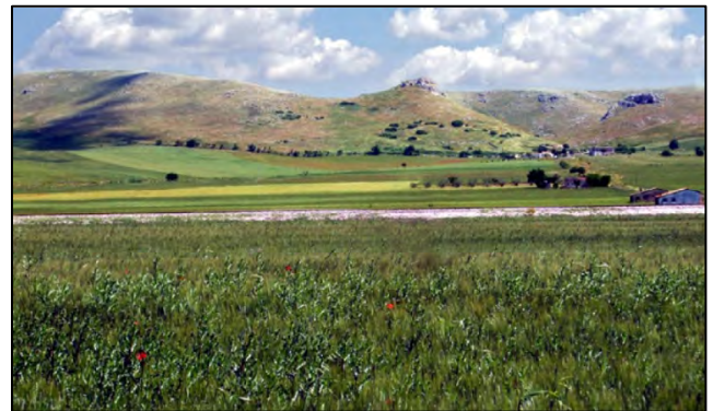
The steep scarp near the town of Spinazzola separates the Murge hills, in Apulia, from the Bradano trough, in Basilicata. This area is part of the Alta Murgia National Park, the first ever rural park in Italy. The breathtaking landscape is enriched by several awesome expressions of karst processes that shaped the Cretaceous bedrock for tens of millions years, such as the reddish bauxite deposits (quarried until the '80s of the last century in the Murgetta Rossa locality) and two among the biggest dolines in Italy: the Pulicchio, near Gravina, and the Pulo near Altamura. On the top of the scarp there is the impressive Rocca del Garagnone, the ruins of a castle built during the middle ages. From the conference website.

More information on the Symposium programme will be given in the Symposium web site. For any additional information, please do not hesitate to contact the Organizing Committee: