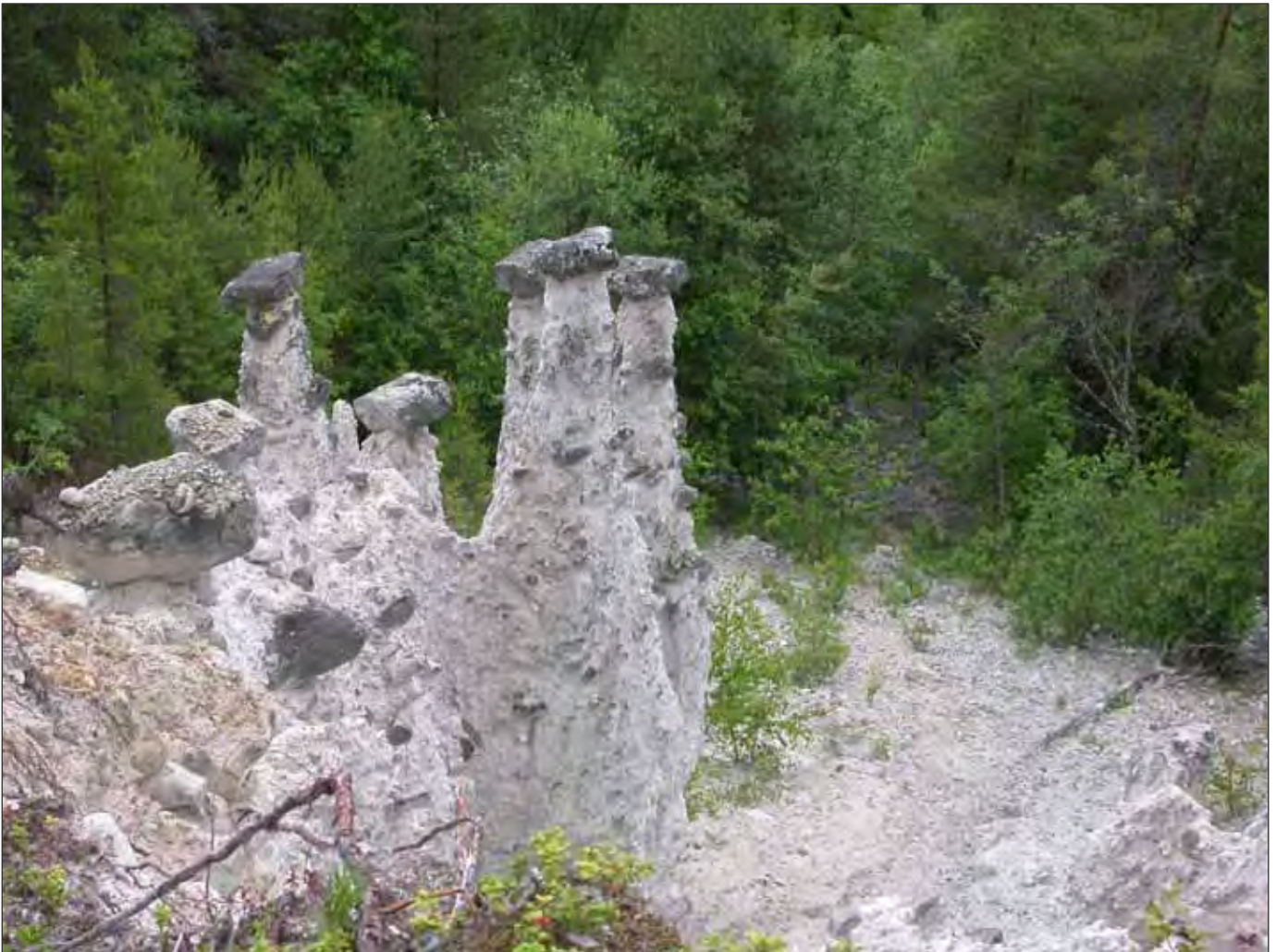
The Kvitskriuprestin Natural Monument, Norway