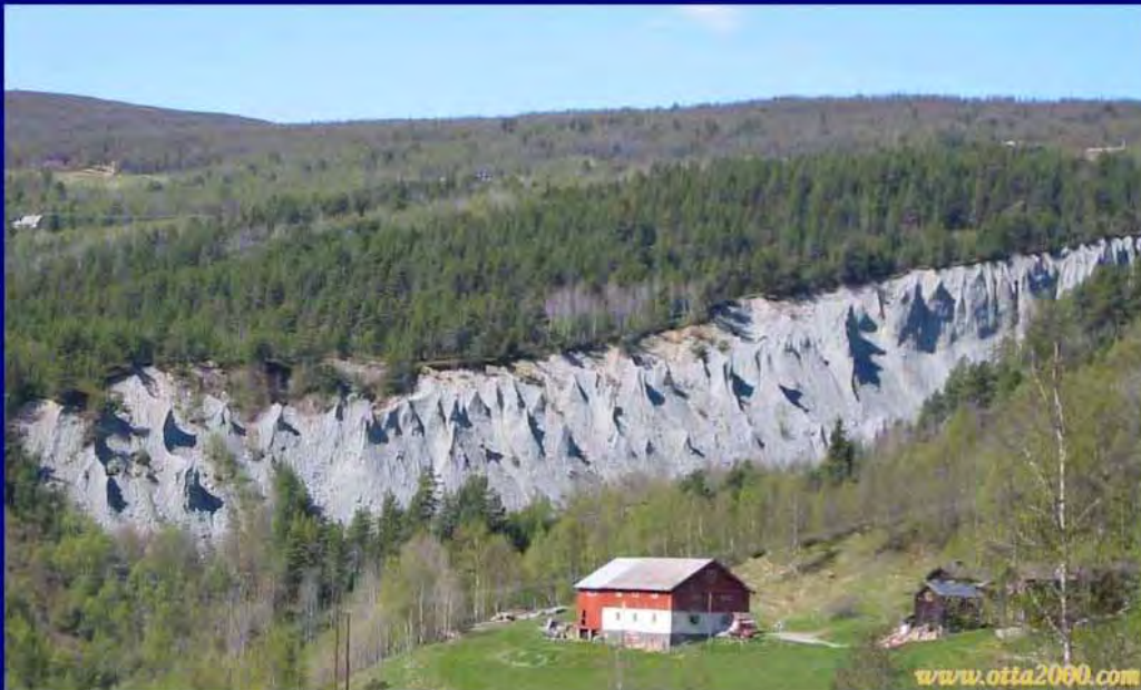
I Skåbu har ein eit liknande fenomen, men desse pyramidane mangler stort sett dei karakteristiske steinhattane og forvitrer difor snøggare.

This case underlines the importance to clarify conservation aim and management strategies when protecting active processes. The need to locally preserve a tourist attraction like this may well be in conflict with the scientific conservation value linked to the process. Lack of clarification may cause severe management problems. The debate of management strategies has the potential to interest local people and as such the area may still play an important role in promoting geo-conservation in Norway.