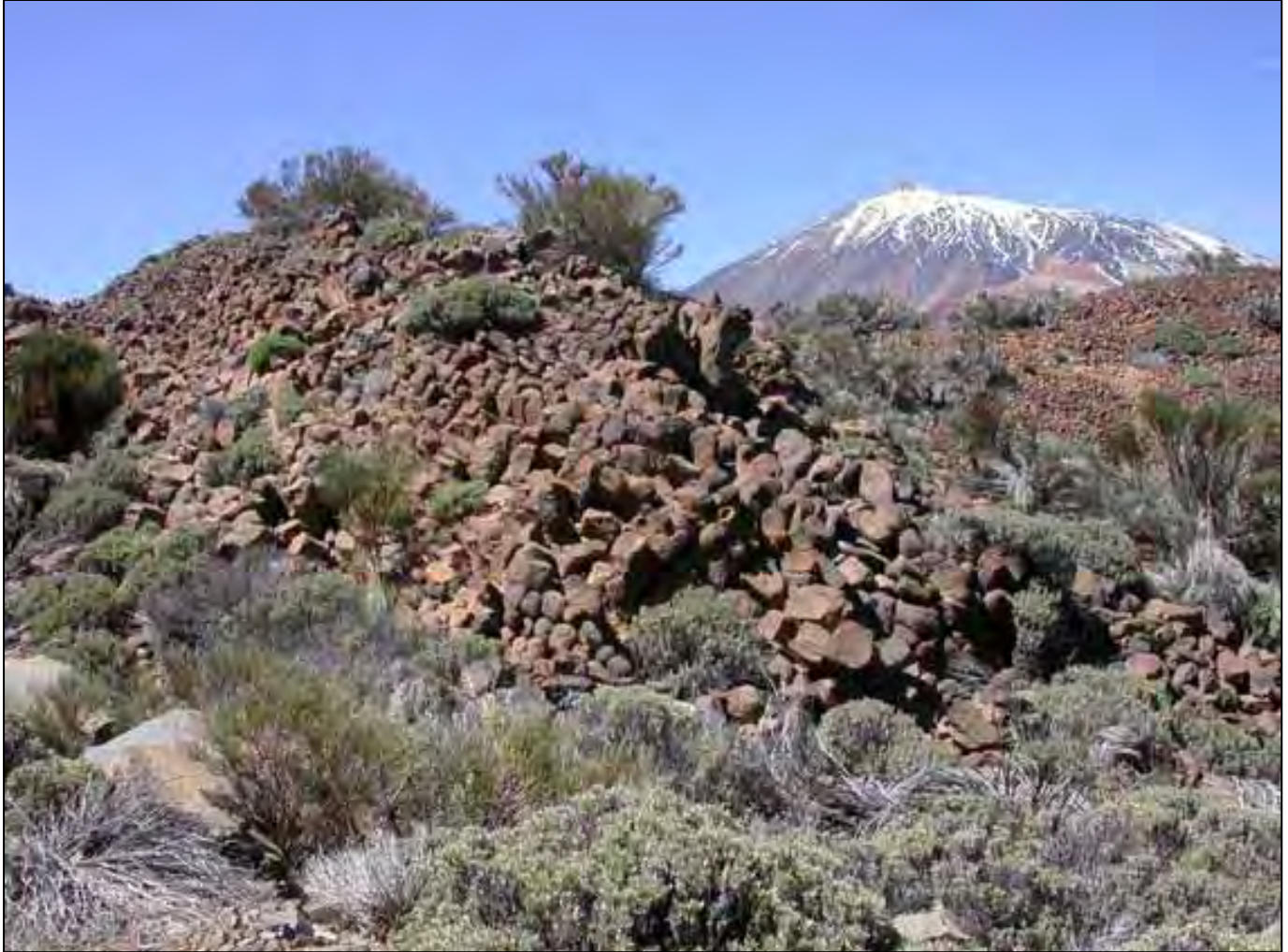
Basalt lavas in front of the volcano Teide on Tenerife, Spain within the Canadas del Teide National Park.

Deadline for the next issue of ProGEO NEWS: 1.6.2006