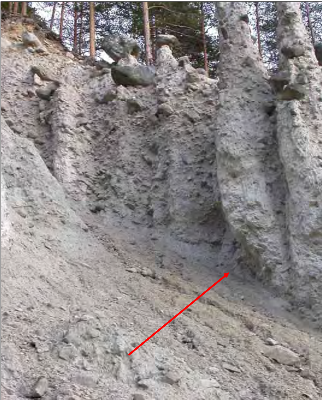
Lateral erosion undermining the largest pyramid complex.

The earth pyramids are formed by ongoing erosion and are linked to the intrinsic qualities of the till (relatively consolidated and with larger stones that forms roofs over the pyramids). The visual impression of the “priests” is accentuated by the light colour (almost white) of the till.