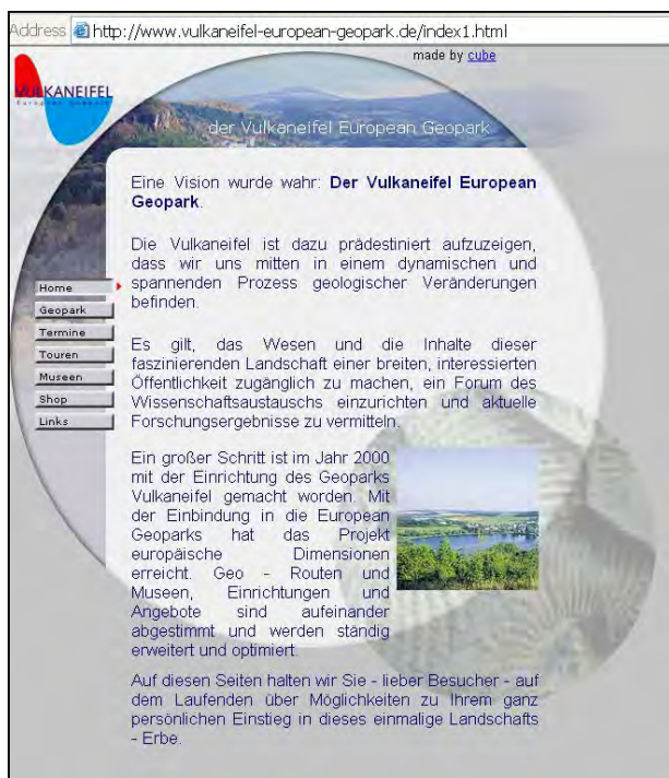
The Vulkaneifel European Geopark presented on the internet.

terms with geodiversity and tourism, the idea of the European Geoparks Network was formed.