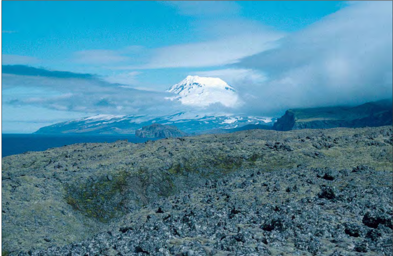
Figure 1: The volcanic island of Jan Mayen with the 2277 m high volcano Beerenberg is now considered to achieve a protected status.