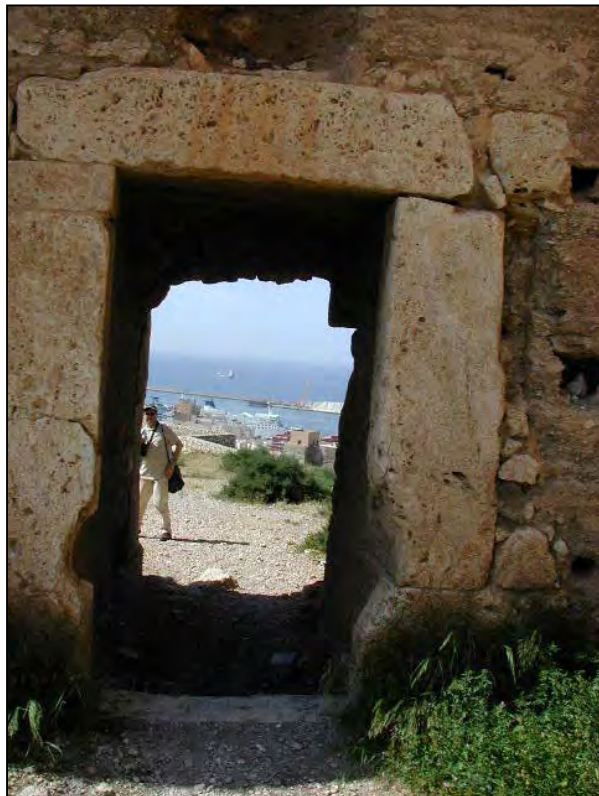
From the roman Castle in Almeria towards the Harbour.

We were invited to talk about best practices, but we have been privileged to learn from your best practice. - We will take home more than we gave! - The whole work that you do, the diversity of your ideas, the quality and the quantity of your studies, your approaches are most impressive. On behalf of all three of us and on behalf of ProGEO, I would say that you represent a great contribution to the geoconservation community.