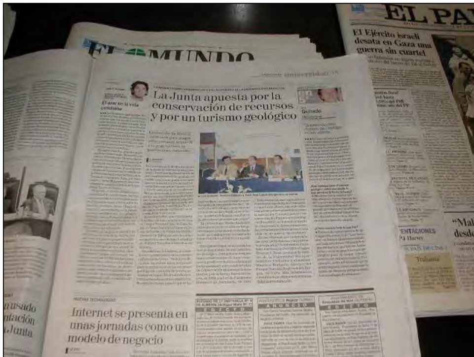
The meeting was well presented in the newspapers.