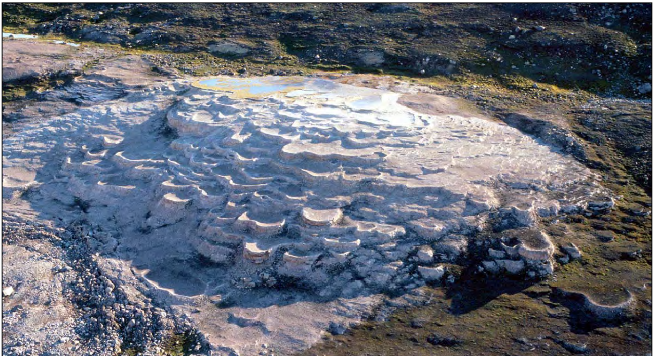
Figure 2: Sinter terrace complex of Trollkjeldane, thermal springs, in the Northwest Svalbard National Park.

As a model, we should look at approaches made in Iceland; where in certain cases scientific committees or societies administer protected sites. One of these examples is Surtsey Nature Reserve, a volcanic island which emerged in 1963 off the southern coast. All hu-