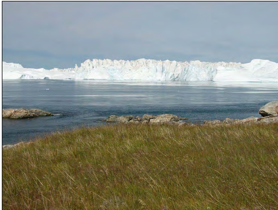
Figure 3: Section of the protected Ilulissat Isfjord, Greenland, a famous ice-filled fiord with an immense production of icebergs. The area is nominated for the UNESCO World Heritage List. The photo shows Eqi (= "corner of the mouth") at the mouth of the fiord, where also archeological sites occur.

man activities there are administered by the Surtsey Society, a combined political/scientific committee. An other example is the Icelandic Speleological Society, which manages access to – and activities in – all protected Icelandic caves. These measures seem to work well.