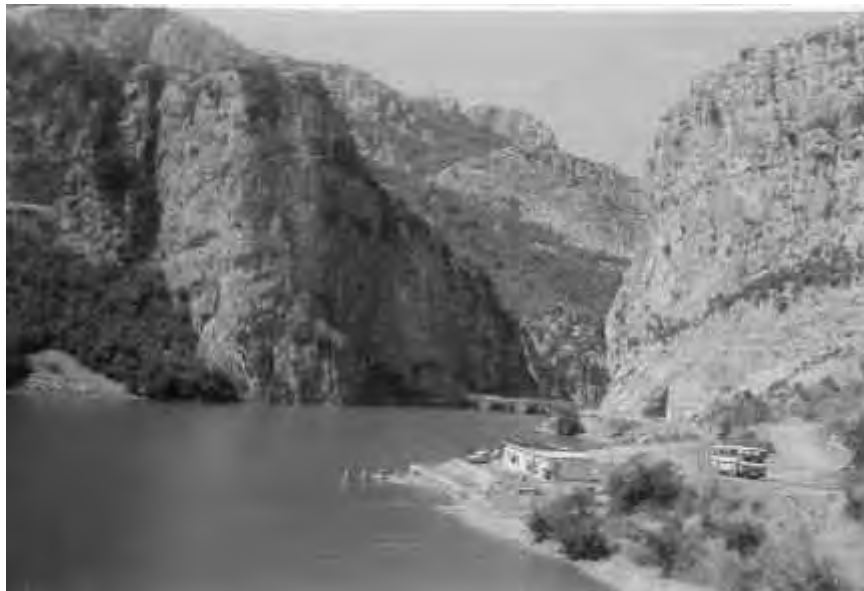
Shopeti Gorge – one of the outstanding geomorphological sites in Albania.

ores and raw materials. In 1971 law Nr4874 for "The Protection of Cultural Heritage and Natural Wealths in Albania" was accepted.