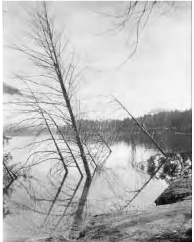
Figure 4. The earthquake effects on buildings and people in Bohinjjski kot were assessed at levels VI-VII EMS, which is confirmed by the damage to nature. A good example is the sliding of part of the Lake Bohinj coast into the water.

The earthquake in upper Soca Territory in the Alpine region of