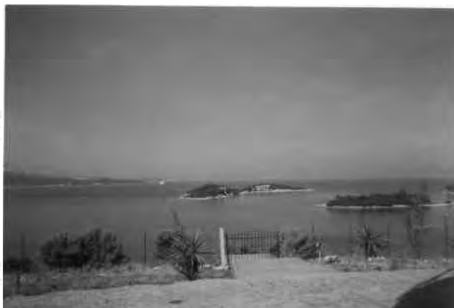
Ksamili Islands at the southernmost part of the Jinian riviera.

In 1947 the law for declaration of all natural wealth in Albania with state ownership was accepted. Later legislation for protection of forests, flora and fauna, declaring some surface as woodlands, hunting lands, national parks, local and recreative parks etc were implemented as well. Concerning natural monuments of geological-geomorphologic character, they were included in laws and decisions for prospecting and exploration of mineral