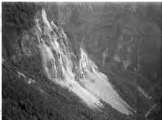
Figure 2. The largest rockfalls (levels VII-VIII EMS) include those on Osojnica. The top of the mountain fell apart and crashed into the valley on three slopes.