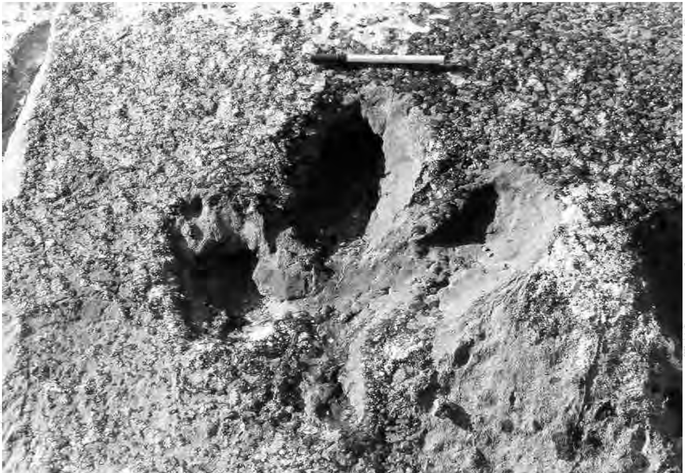
Dinosaur footprints from one of the sites on the pre-symposium fieldtrip