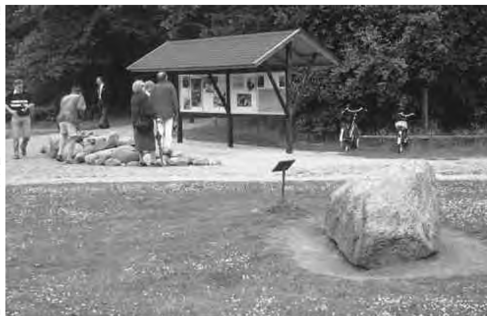
Erratic boulder display on a protected site in the Netherlands. From the very first ProGEO meeting in 1988.