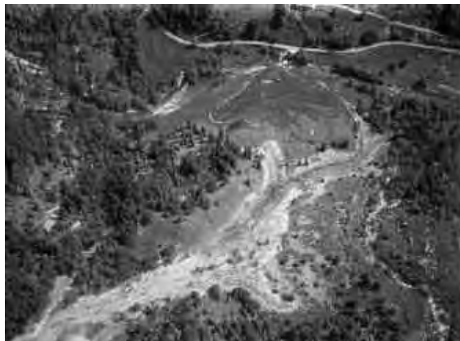
Figure 3. In the area where damage to buildings was assessed as level VII EMS, interesting phenomena appeared in nature. At the head of the Lepena valley, a mudstone flow appeared which is very rare in Slovenia. The appearance of similar phenomena is assessed as level VII of the EMS.

Mud-stone flow in Lepena The mud-stone flow from the left slope of Lepena appeared when the stones deposited in the steep ravine were released during the earthquake and started to roll down the ravine. Stone flows are characteristic of areas of the Himalayan mountain range. In Slovenia, they have not yet been described. During this, rocks and stones of average dimensions from some decimetres to some centimetres started to mix with snow which also filled the ravine in a thick layer. In the lower parts of the ravine, the increasingly fast rolling and sliding mass of snow and blocks of stone, already closing the Lepena valley, also started to skim off the ground clay of weathering cover deposited in several metre thick layers. The mixture of snow, gravel, stones and rocks produced a muddy mass which, after falling out of the ravine,