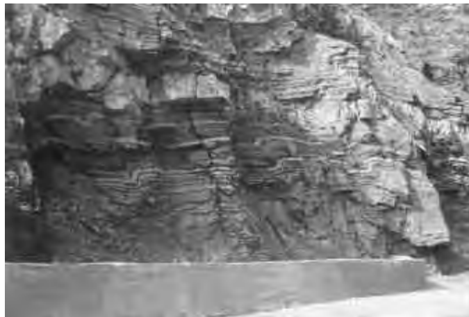
Part of the Komani site with foldings of marly limestones of different colours.

The first data of directly geological-geographical character about Albania were presented at the end of the nineteenth century and during the beginning of the twentieth century by foreign geographers and geologists. Concerning geological heritage we can note that the first findings