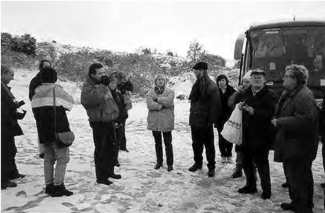
Spanish winter on the pre-symposium excursion