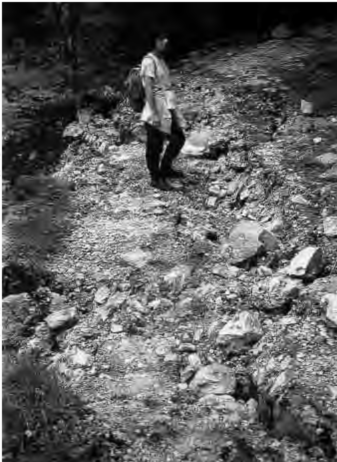
Figure 1. The cracks in partly agglutinated gravel on the slopes along the path leading to the source of the Tolminka river are characteristic of level VI EMS.