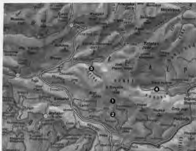
Position of damaged area in the upper Soca Territory (Slovenia).