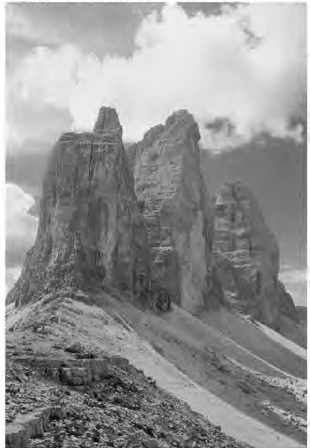
Tre Cime (Three Towers) di Lavaredo: one of the most popular geosite in the Dolomites. The highest of the towers reaches an altitude of 3.000 m and is high about 600 m. The rock is Upper Triassic dolomite in perfectly marked horizontal strata.

"Piramidi di Terra" (Earth Pillars) of Segonzano (Trento). Earth pillars are formed by the denudation carried out by rainfall and surface water over moraines, in which large boulders are embedded. The