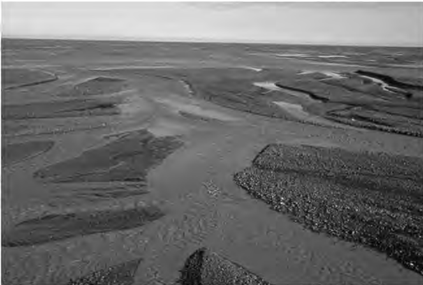
The sandurs of southeastern Iceland, highly active geotopes and part of our geological heritage.