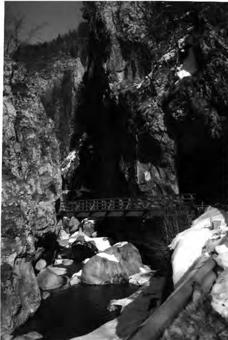
The initial part of the Dolžan Gorge.

The Dolžan gorge in the valley of the Tržiška Bistrica river north of the town of Tržič, Slovenia, cuts deep in the Karavanke Mountains. From the geologic point of view, this is one of the most interesting and most well known parts of Slovenia not only owing to the scenic geomorphology (gorge, rock-pyramids), but also owing to the profile cut through Carboniferous, Permian and Triassic beds, and es-