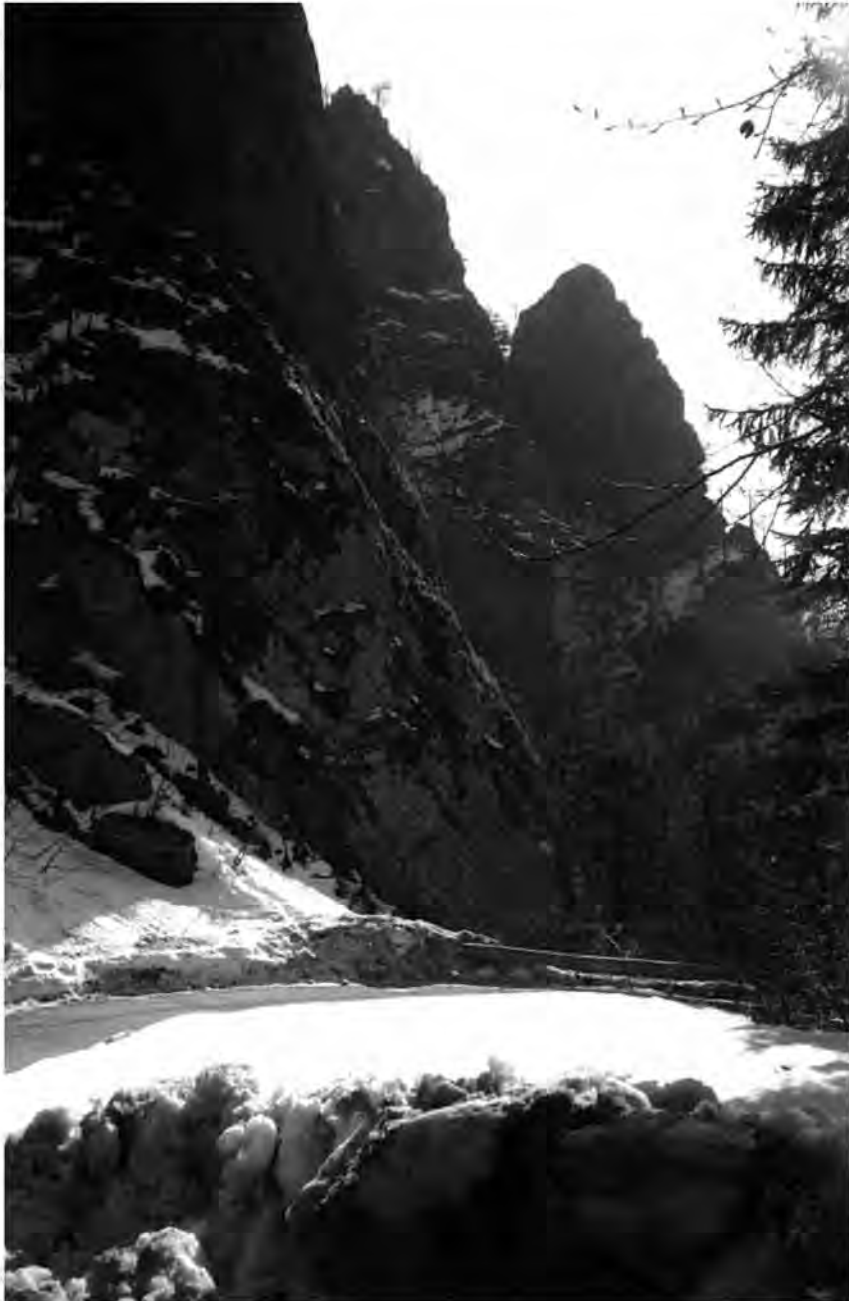
Rock pyramids with Lower Permian corals.

F. Teller was the first to collect the fossils aided by the local people. Brachiopods and other fossils were studied by E. Schellwien. The first publication appeared in 1898, and the most important one in 1900. Owing to very detailed descriptions of brachiopods, this work became a basis for later studies of the Lower Permian brachiopods in the Southern Alps. F. Heritsch in 1933 described the