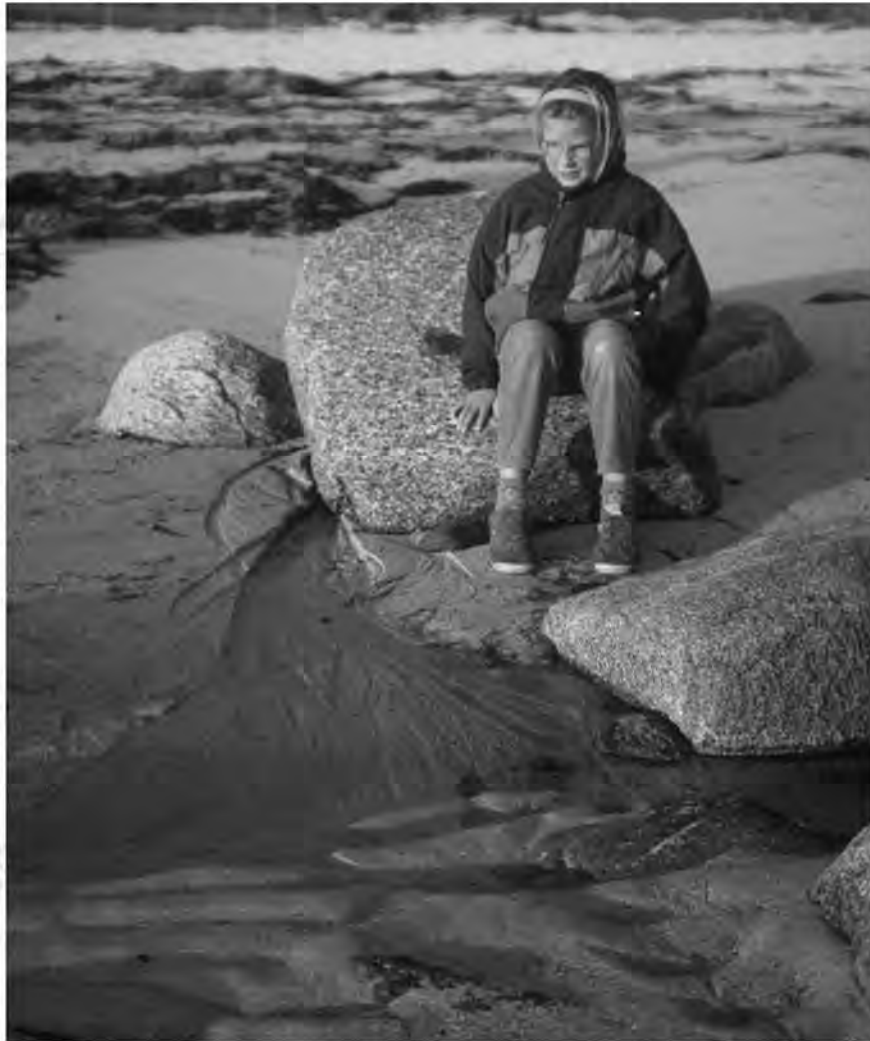
Geodiversity on a detailed and personal scale