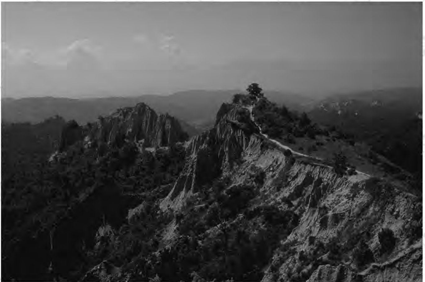
Melnik pyramids at the ProGEO 98 excursion, Bulgaria.