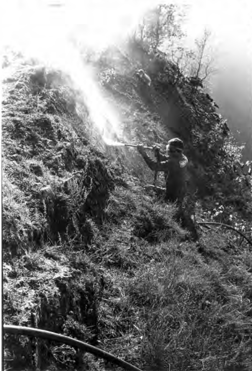
Wet sandblasting performed on a rock surface at Domkirkeodden, Hamar.

At Gjettum , near Oslo, a vertically tilted limestone of Silurian age was treated with wet sandblasting. The rock surface belonged to a road cutting several decades old that was going to be expanded due to the building of a new bicycle route. Therefore heavy damage could be risked as part of the experiment. The wet sandblasting method proved very efficient, and removed easily grass, mosses and lichens. However, we also discovered that this method had the capacity to alter the surface characteristics. Naturally weathering on this rock give a positive relief to the fossils