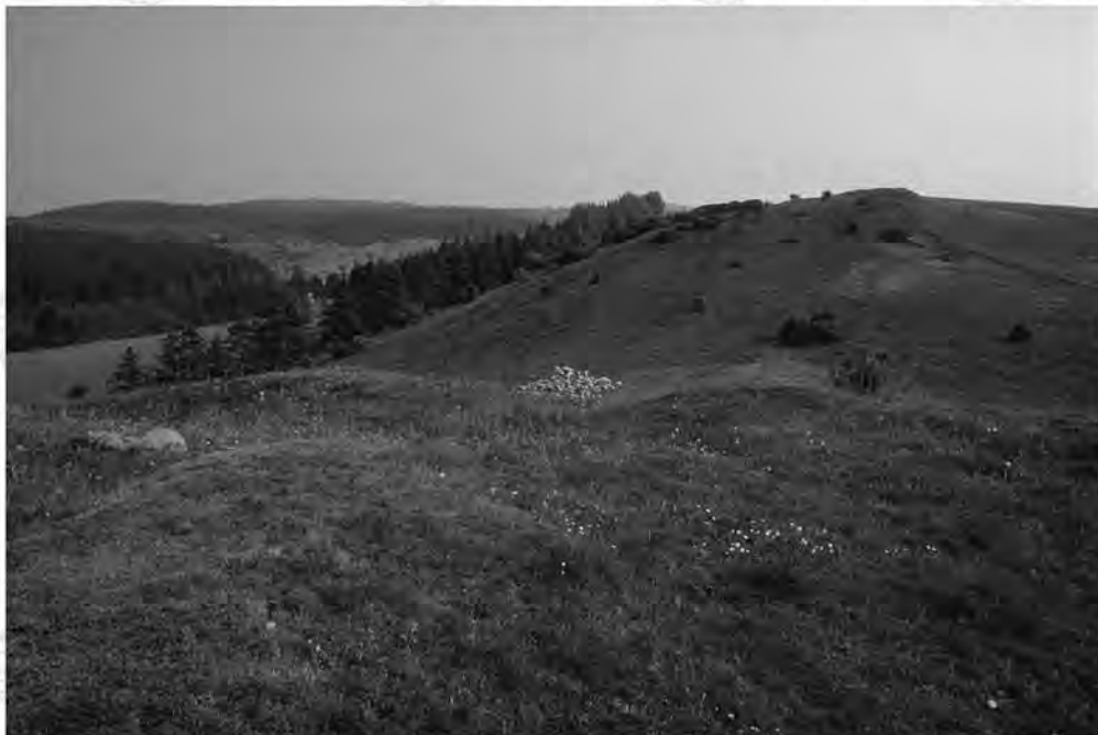
Nordic geodiversity in end moraine formation. Above: late Younger Dryas moraine from Dovre, South Norway. Under: much older moraine complex "Mols Bjerger", Jylland, Denmark. Note the diversity in age, location, scale and complexity within this same landform group.

landscape diversity. It gives the frames and structures for ecosystems and biodiversity.