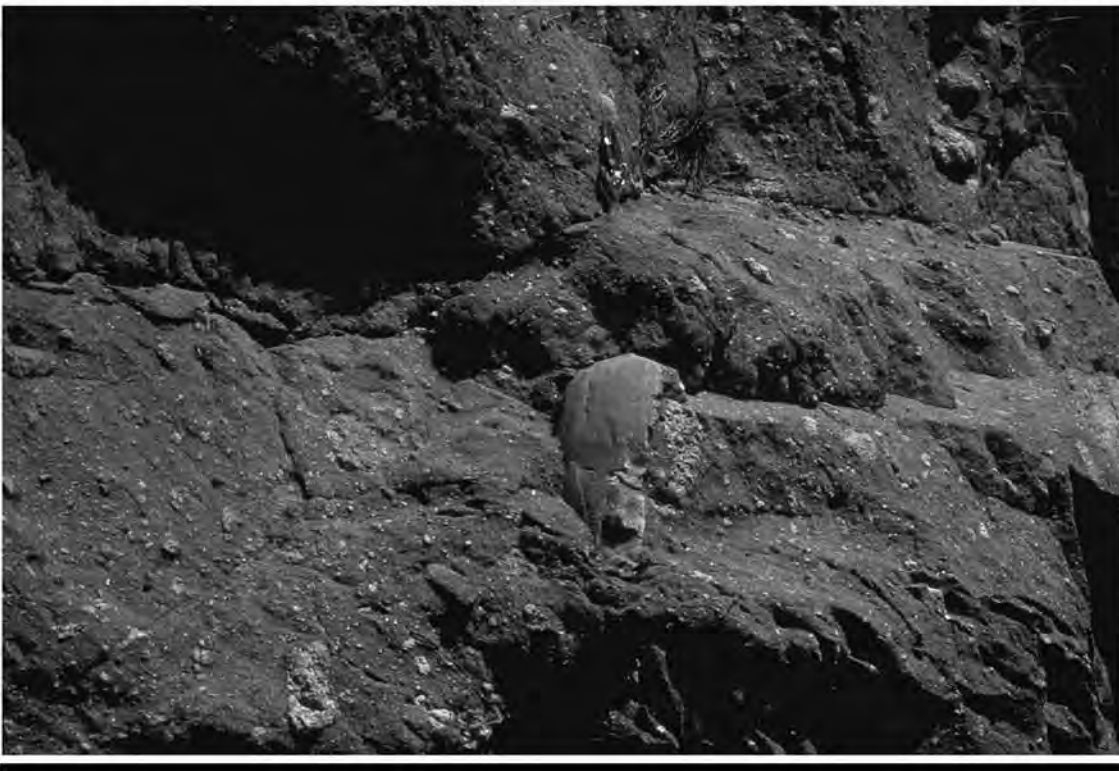
The locality at Moelv Brygge. Note the outcrop to the right in the picture above compared with the rest of the outcrops. The difference is due to the treatment. The picture below is a detail from this outcrop after treatment.