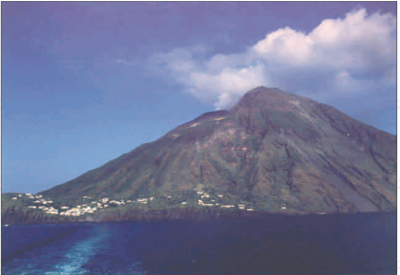
Fig.3 - Stromboli view from South: Ginostra village on the left, Secche di Lazzaro locality on the right.

The first «geological path» of the Aeolian islands deserves attention because of particular geological