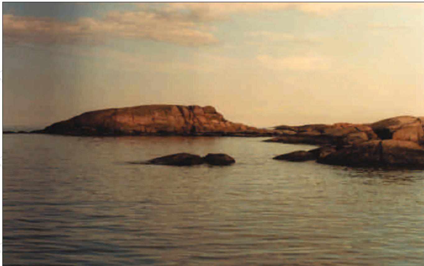
The photo here by Carl Erik Johansson shows glacially sculptured granitoid bedrock in Bullerö Nature reserve, Stockholm Archipelago. Bullerö is planned to be part of a new National park in the National park plan for Sweden. (Swedish Environmental Protection Agency). The Stockholm Archipelago is proposed as a World Heritage Site in the Nordic report Verdensarv i Norden (Nordic Council of Ministers, Tema Nord 1996:39).

Schlüchter, C. 1997. Vom menschlichen Eingriff zum Geotop? Zbl. Geol. Paläont. Teil1 1995 H. 7/8: 787-792.