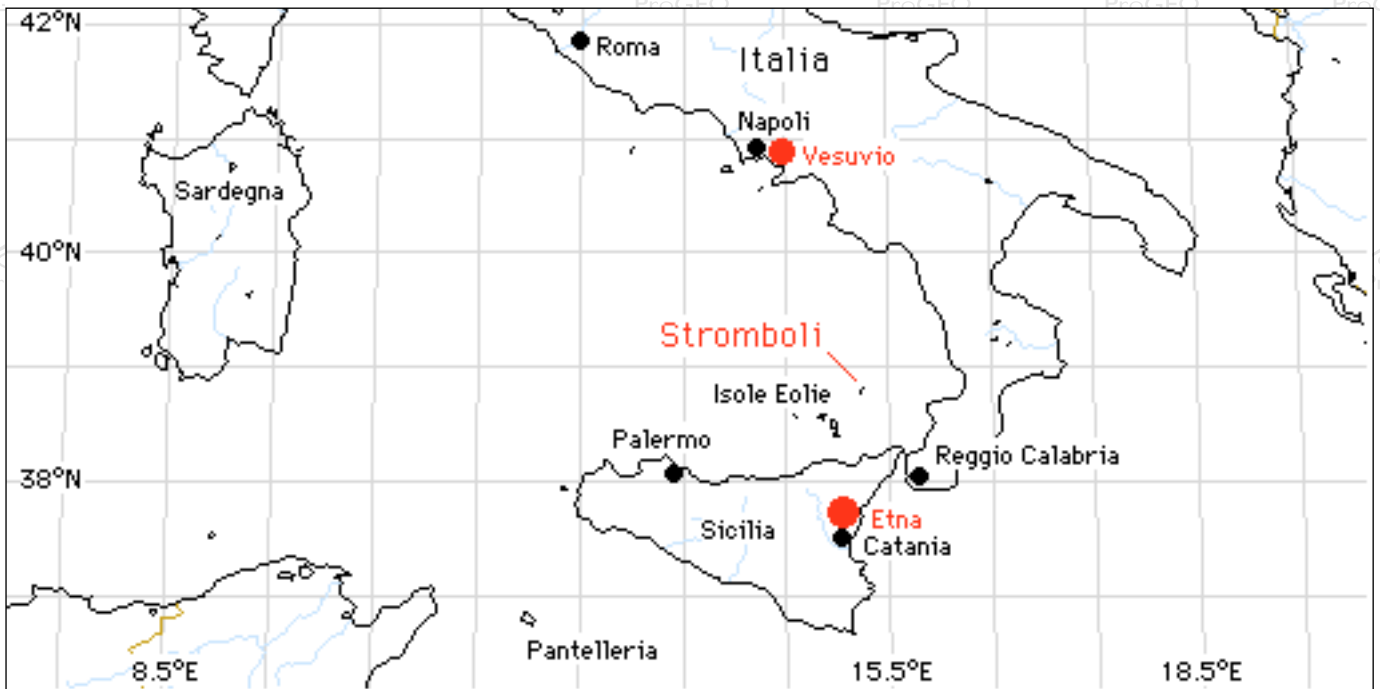
Fig.1 - Map of Southern Italy