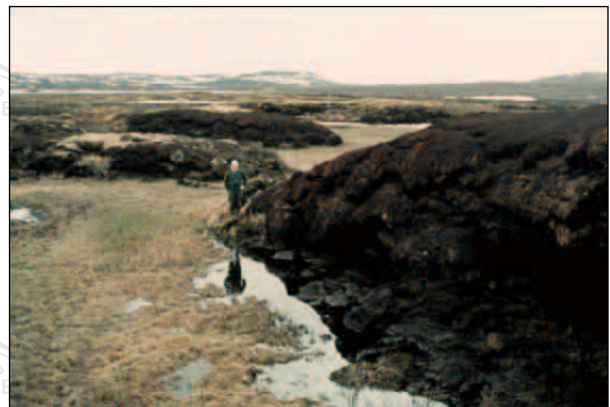
The photo by Rune Frisén shows palsas (peat mounds expanded by frozen water) in the large mire complex Sjaunja and a nappe front to the west.