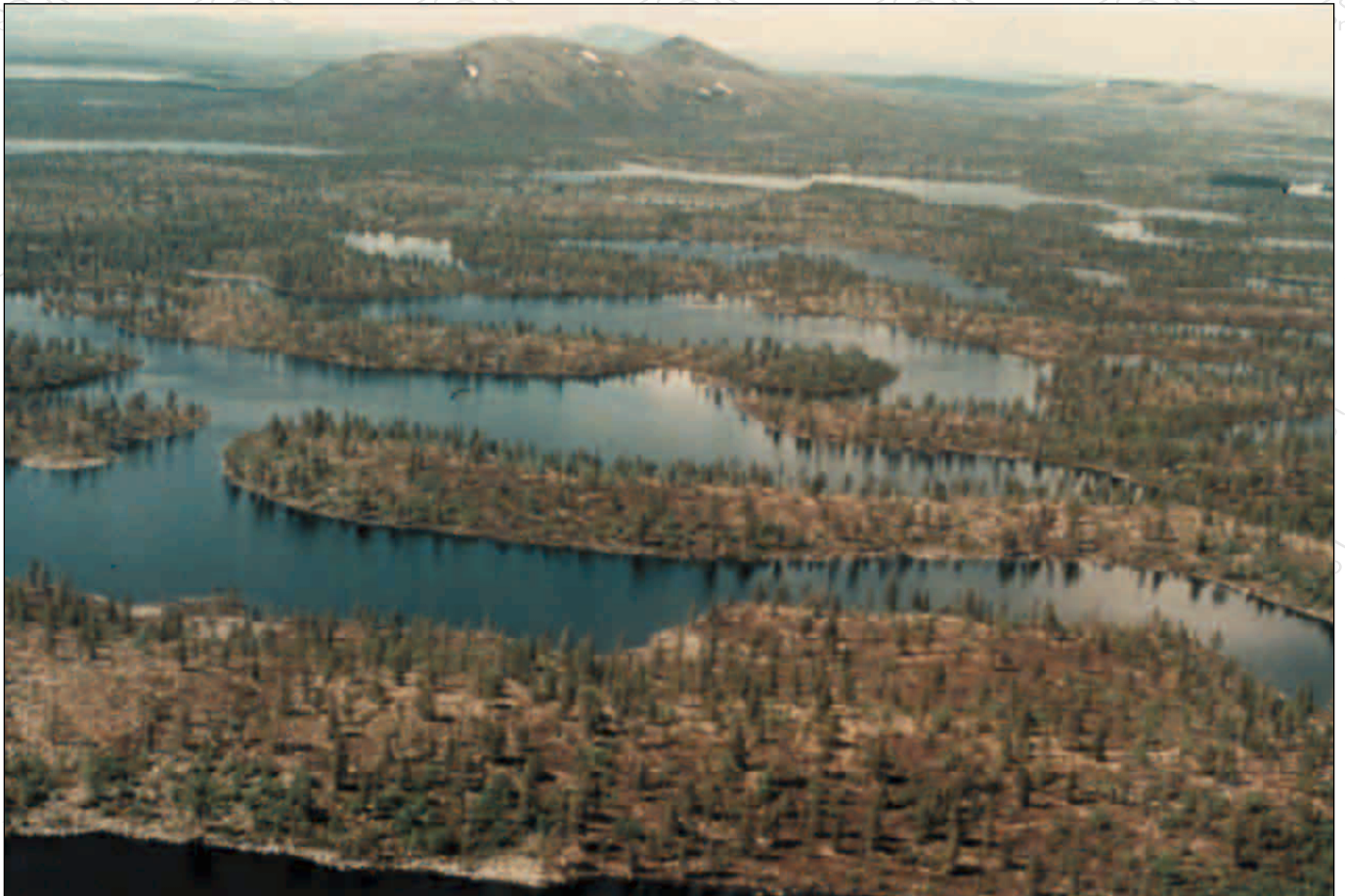
The photo on the front page shows a part of the Rogen Nature reserve in Central Sweden, adjacent to Femundmarka National park in Norway. This is the type site of the famous Rogen moraine, one of the ribbed moraine types surveyed by Hättemark.